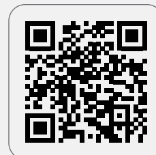
Penguin of Concern Referral Form

For non-emergency student referrals, please submit a Penguin of Concern form by scanning the QR code below.