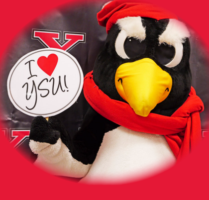
You can access these resources no matter where you take your classes, including at your high school.