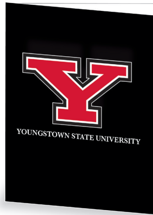
University Y black folder

9 x 12" Folder | 2-4" interior pockets Business card slits on left pocket available upon request. University logo there will be removed.