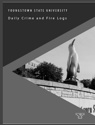
YSUPD Daily Crime and