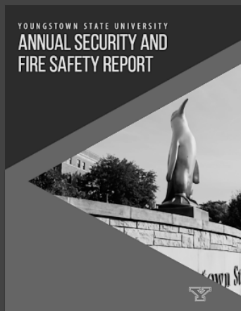
2023 Annual Security and