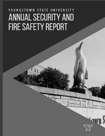
2023 Annual Security and Fire Report