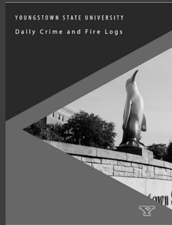
YSUPD Daily Crime and Fire Logs