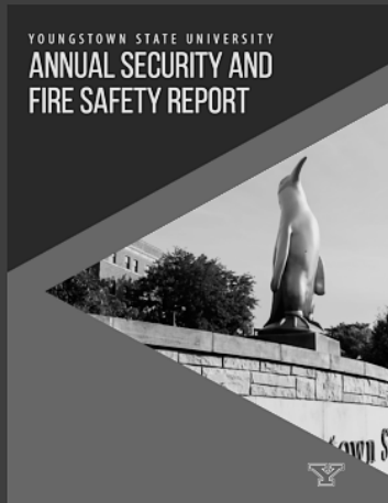
2022 Annual Security and Fire Report