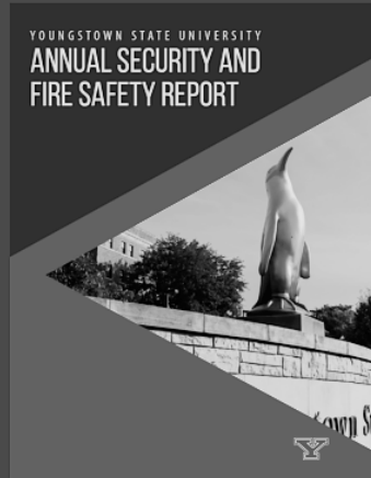
2022 Annual Security and Fire Report