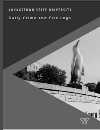
YSUPD Daily Crime and Fire Logs

In keeping with the mandates of the Jeanne Clery Disclosure of Campus Security Policy and Campus Crime Statistics Act (Clery Act), the University's Annual Report contains statistics of certain crimes that are reported and that occurred on campus, in certain off-campus buildings or property owned or controlled by the University or an officially recognized student organization, and on public property within or immediately adjacent to and accessible from the campus for 2021, 2020 and 2019. Also included are campus security policies including those related to missing student notifications, alcohol and drug use, sexual assault, relationship violence, stalking, crime prevention, the reporting of crimes, and fire safety policies and statistics. All YSU faculty, staff and students are encouraged to read the report and to report all criminal incidents promptly to the YSU Police Department at (330) 941-3527 or 911 from a campus telephone.